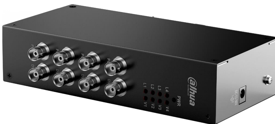
DH-PFM811-4CH PSE End (Power sourcing equipment)