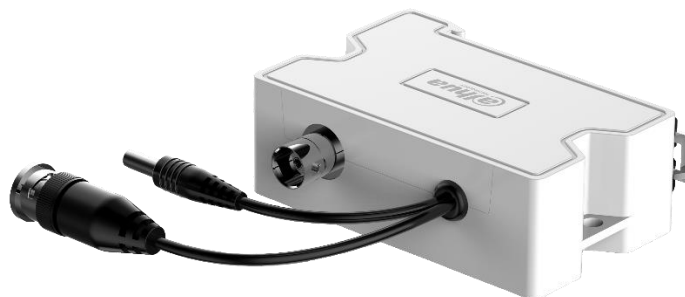
DH-PFM811-C PD End (Power device)